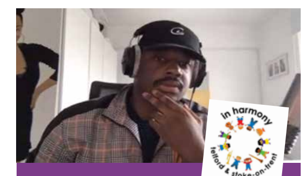
In Harmony Year 6 Creative Rap & Music Video

On Thursday 18th June, Year 6 children from Old Park Primary school took part in a specially designed creative music workshop day. Originally due to take place face-to-face, the workshop took place over Microsoft Teams in an experimental way so that 45 children were able to work with 4 creative artists. The children were spread over 4 classrooms, socially distanced from each other and the 4 creative artists worked with them from home.